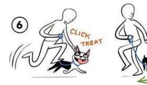
Then start changing direction and speed.