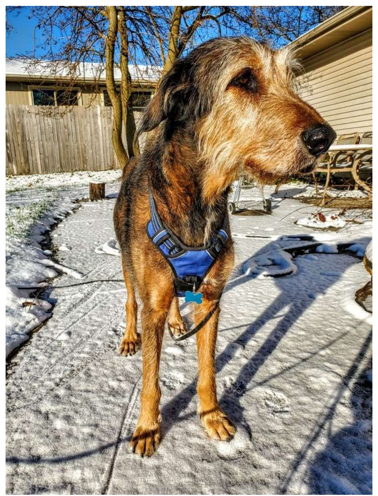
An appropriate Y-shaped harness with a clip in the front and the back.