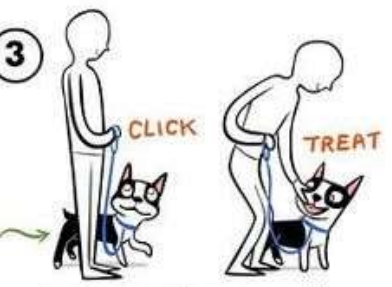
As soon as your dag moves even the tiniest step closer to you, click and feed at the "ideal" head position.