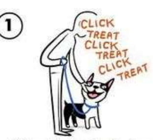
Click and treat rapidly a few times in the correct position.

PRACTICE WITH DOG Practice holding the leash at your bellybutton as you click and feed.